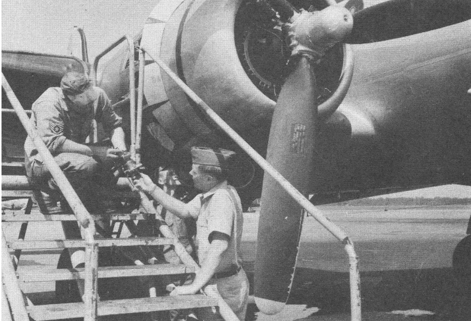
Flightline Maintenance duty officer checks out hydraulic pump with mechanic.